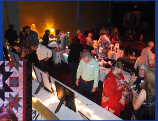
Top: Attendees check out all of the silent auction items before bidding closes.