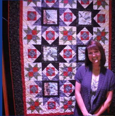
Center: The proud winner of the white-breasted nuthatch quilt claims her prize. Bottom: Guests enjoy the delicious appetizers served at the event.